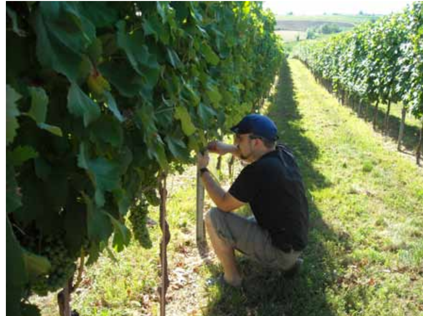
Bunch sampling in the Italian experimental vineyard.